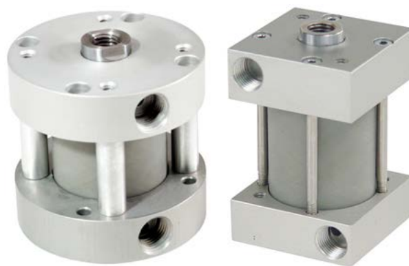
In addition to a bored body design, Pancake® cylinders are available with round and square designs (left and right) in a conventional tie-rod/spacer configuration.

In addition to specifying the right configuration, it's important to make sure your compact air cylinder meets the proper size requirements. Due to their use in tight or limited spaces, look for standard bore sizes between 0.5 and 4 inches, as well as standard strokes up to 4 inches.